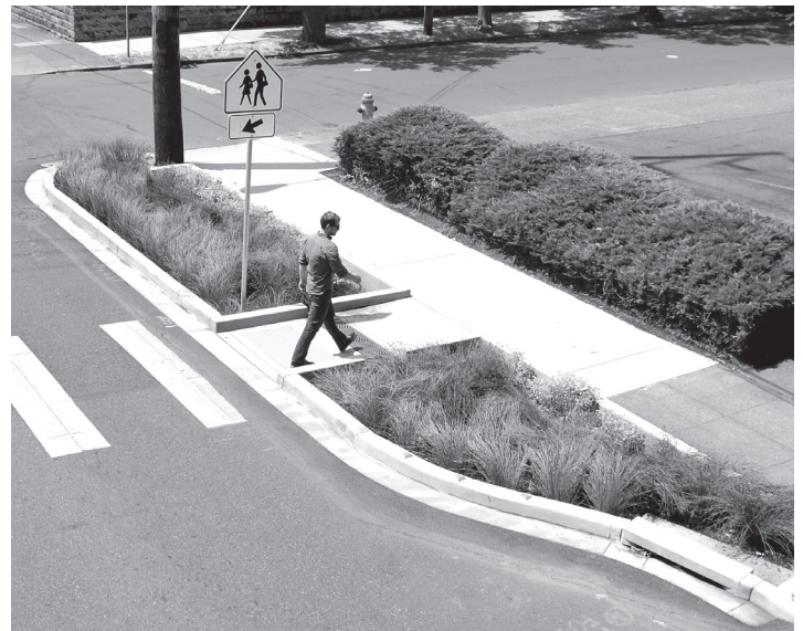
SE Belmont and 42nd vegetated curb extension.

Portland's Bureau of Environmental Services started work in September on the SE Clay-Taylor Reconstruction and Green Street Project. The project includes installing new sewer pipes to increase system capacity, and constructing green street facilities to manage stormwater and keep runoff out of the sewer system. The work is part of the Tabor to the River Program, which will improve sewer and stormwater management systems in neighborhoods from the Willamette River to Mt. Tabor, between SE Hawthorne and SE Powell boulevards.